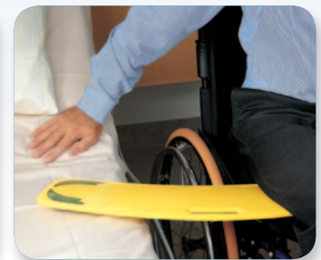
SAMARIT Nursing Aids

Download your language from our website or ask your local distributor.