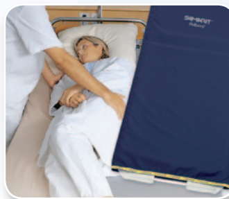
SAMARIT Rollbord H-Line