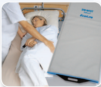
SAMARIT Rollbord ECOLite