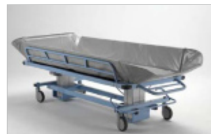
Head end rail folds to horizontal position for extra length.