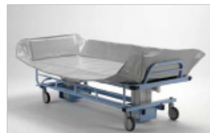
Side rails swing down or lock in horizontal position for transfer and up position for transport.

The side rails keep the person safely in place. Side rails swing down for transfer and lock into up position for persons safety and a secure transport. The trolley has central foot operated castor brakes and straight steering. For a tall person the head end rail can be folded to a horizontal position for extra length. The stretcher has two positions, flat for transfer, tilt for transport, shower and improved drainage. The TR 4000 is delivered with a mattress, high capacity rechargeable batteries, hand control, drain plug and hose.