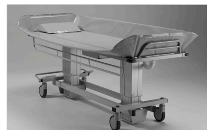
Side rails swing down or lock in horizontal position for transfer and up position for safe transport.

The side rails keep the person safely in place. Side rails swing down for transfer and lock into up position for person security and a secure transport. The trolley has central foot operated castor brakes and straight steering. The stretcher has two positions, flat for transfer and tilt for transport, shower and improved drainage. TR 4200 is delivered with mattress, high capacity rechargeable batteries, hand control, drain plug and hose.