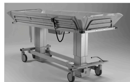
Tilting for "Trendelenburg" position and easy drainage.